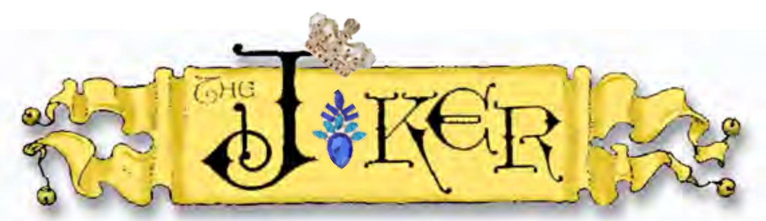
Volume XXX V @ <a href="http://foolsguild.org">http://foolsguild.org</a> Bijou Precioux Deux Joker